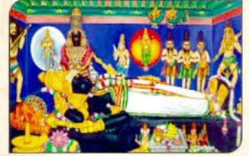
Surutapalli Siva Temple