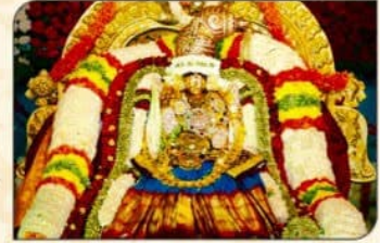
Sri Alamelu Manga Temple