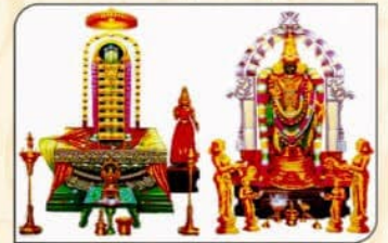
Sri Kalahasti Temple