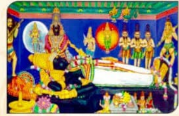
Surutapalli Siva Temple