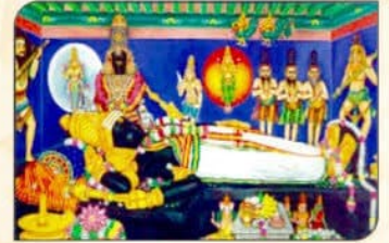
Surutapalli Siva Temple