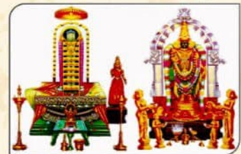
Sri Kalahasti Temple