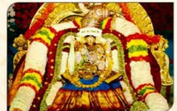
Sri Amalamelu Manga Temple