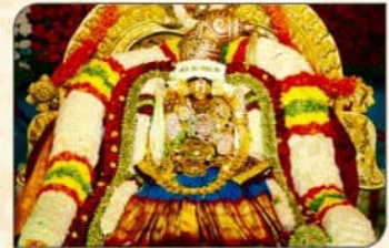
Sri Alamelu Manga Temple