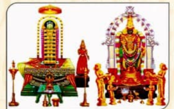
Sri Kalahasti Temple