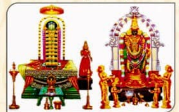
Sri Kalahasti Temple