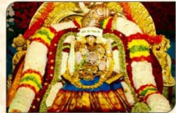
Sri Alamelu Manga Temple