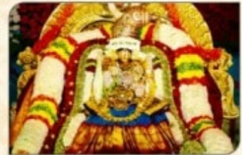
Sri Amalamelu Manga Temple