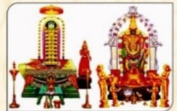
Sri Kalahasti Temple