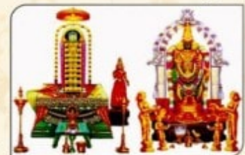
Sri Kalahasti Temple