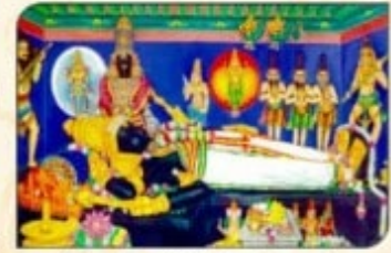
Surutapalli Siva Temple