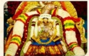
Sri Amalamelu Manga Temple