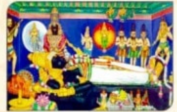
Surutapalli Siva Temple